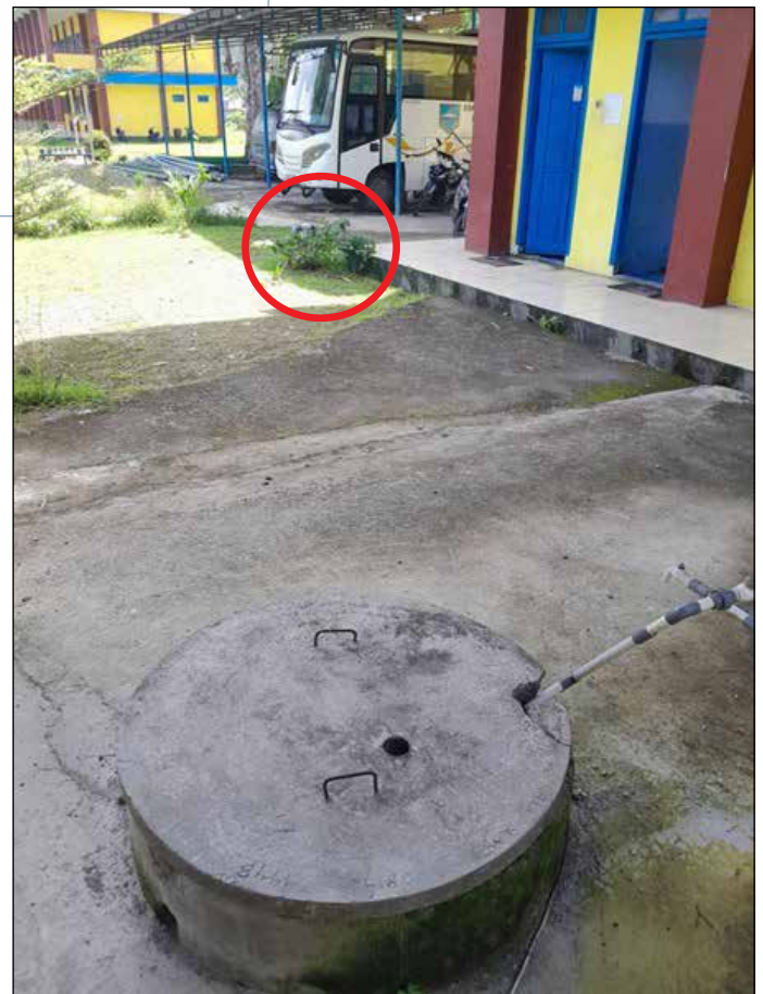
The photo below right shows a shallow well (with the manhole lid on top), with a static water level of 6' below grade, approximately 20 feet from a septic tank (pipe sticking up near the corner of the building).

My time in Indonesia has made me very grateful to be part of such a great industry. In Minnesota, we may not always see that what we do matters but when you take away the standards it