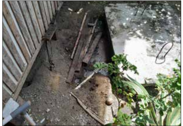
The before pictures show the surfacing wastewater from the systems that were eventually replaced with the constructed wetland systems above.