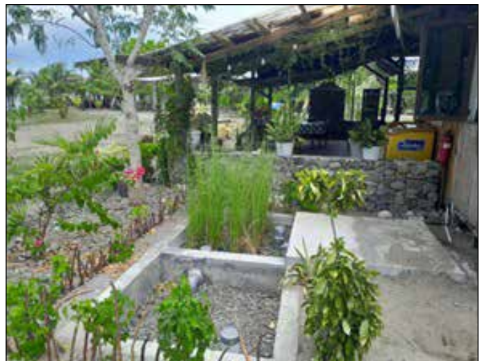
The finished constructed wetland systems with a septic tank followed by a gravel/rock constructed wetland followed by a small seepage bed.